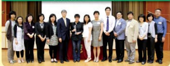
家長講座 - 港孩