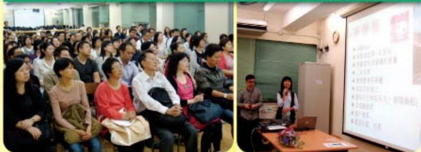
家長講座 - 了解新世代青少年的心態