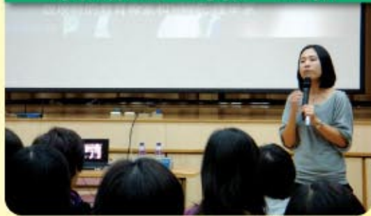
家長講座 - 身教 · 心教